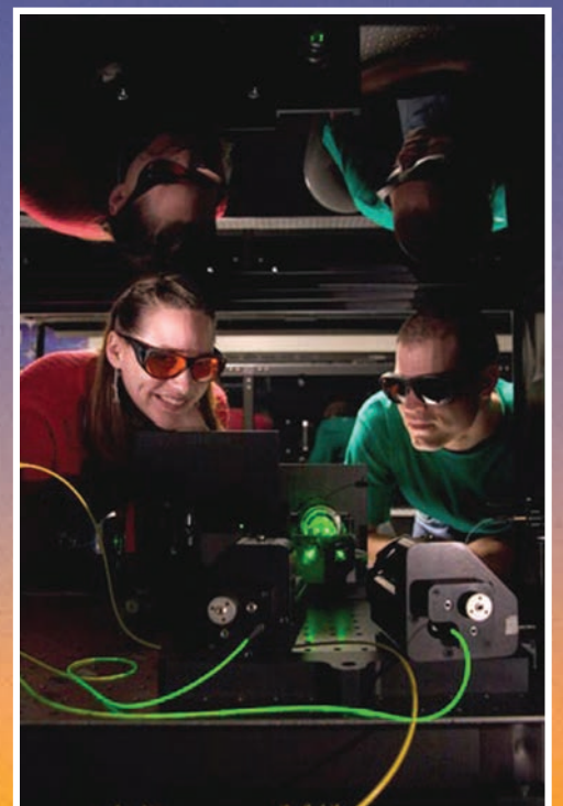
University of California, Santa Cruz