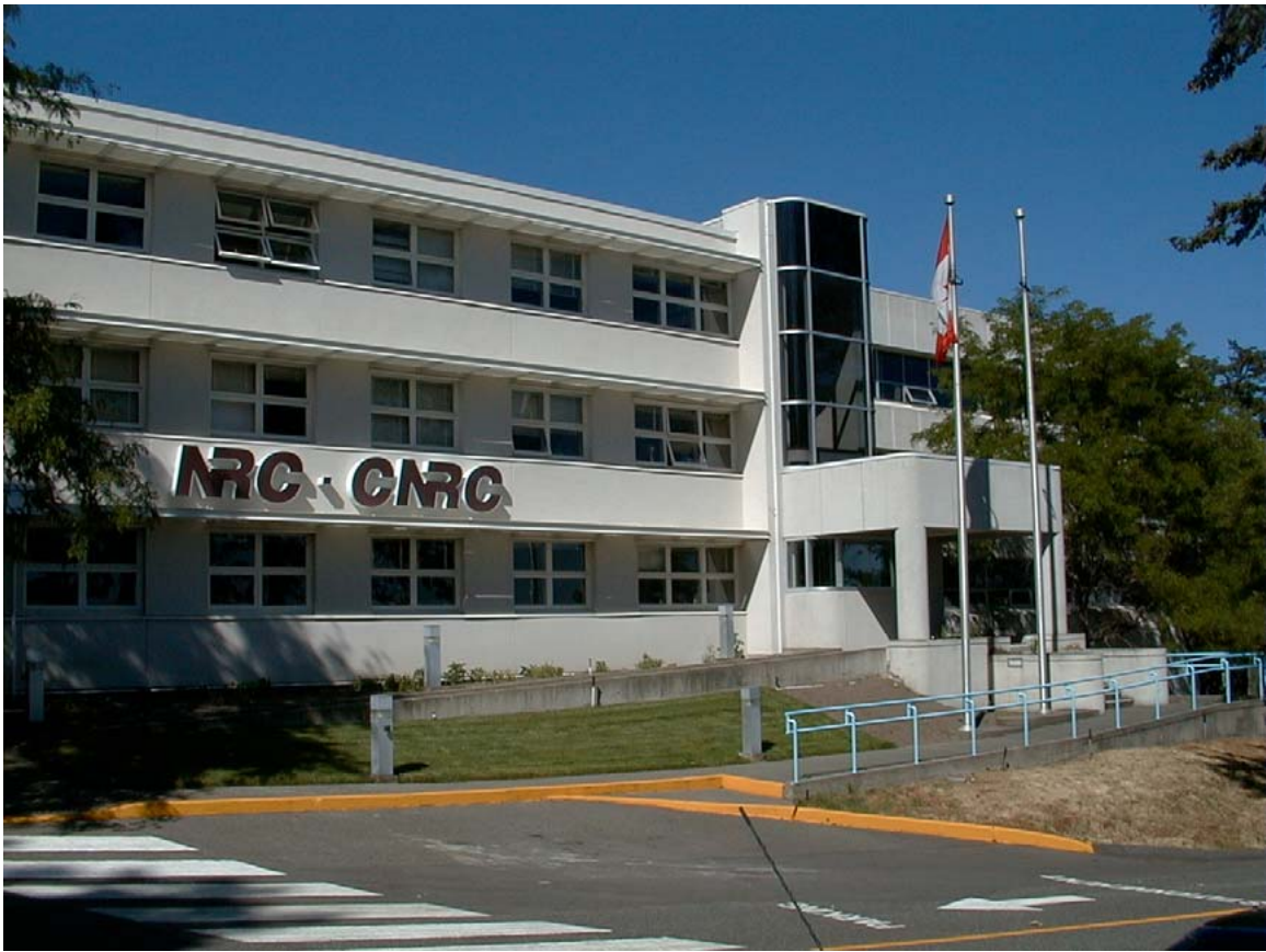
NRC-HIA: Victoria Office Building Main Entrance