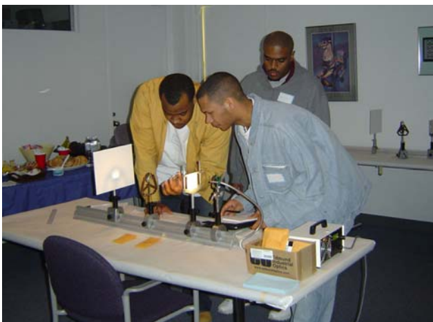
Monroe Community College students at the 2004 Saturday Open Lab